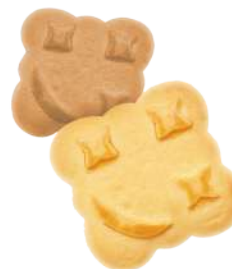
"Ayly Agsham" classic sugar cookies