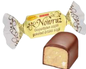
"Novruz" marmalade sweets in chocolate glaze with condensed milk