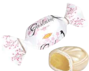
"Garlawach" milk caramel