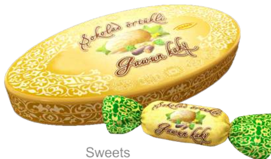
Sweets "Melon in chocolate" 400g