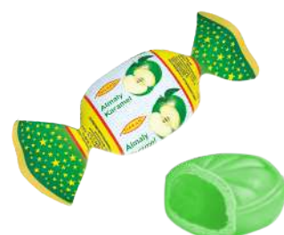
"Apple" classic caramel with liquid filling