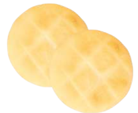
"Nygmat" butter biscuit with chocolate filling