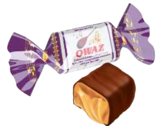
"Owaz" toffee with chocolate glaze