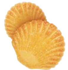
"Shohle" classic sugar cookies