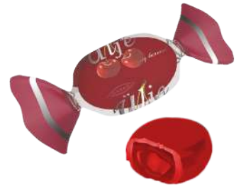
"Cherry" candy caramel with liquid filling