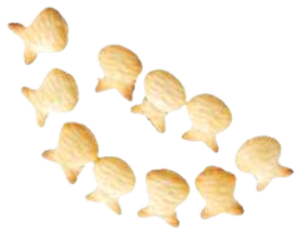
"Fish" classic salted cracker