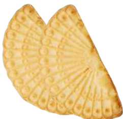
"Tavus" classic sugar cookies