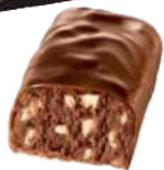
"Kenar" sweets with a delicate chocolate-nut flavor