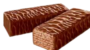
Waffles in chocolate glaze