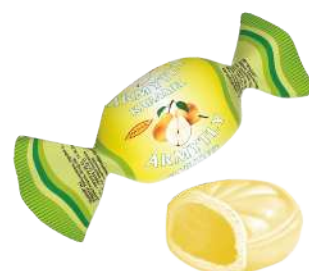
"Pear" classic caramel with liquid filling