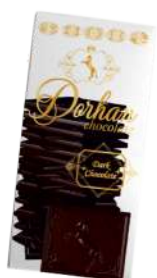
"Dorhan" 100g chocolate bar (dark chocolate 52%)