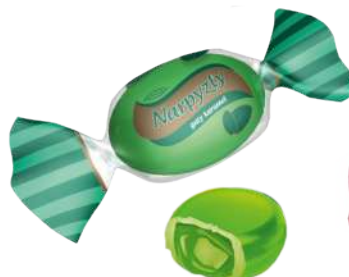
"Narpyzly" candy caramel with liquid filling