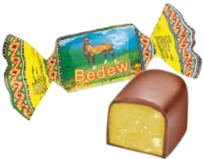
"Bedev" marmalade in chocolate (lemon)