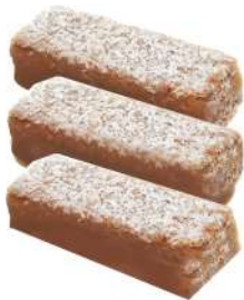
Waffles in chocolate glaze (with coconut flakes)