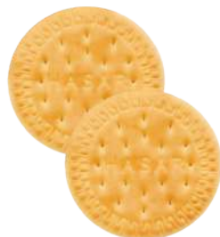
"Gunesh" classic short dough cookies