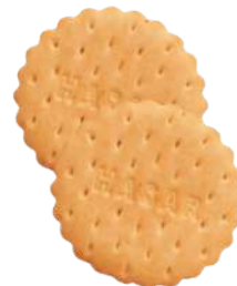
"Petir" classic short dough cookies