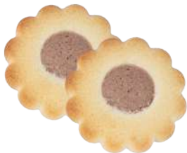
"Gulyaka" classic butter biscuit with cocoa center