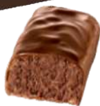
"Kerven saray" sweets with a delicate chocolate flavor