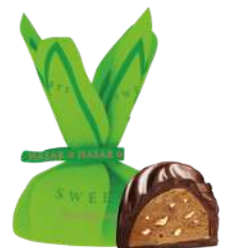
"Baydakly" chocolate sweets with crushed peanuts