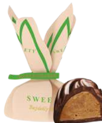
"Baidakly" chocolate sweets with Espresso taste