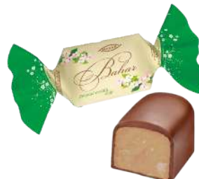
"Bahar" marmalade sweets in chocolate glaze with condensed milk