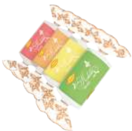
"Kebeleck" marmalade with taste of natural fruits