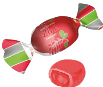
"Zirk" candy caramel with liquid filling