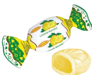
"Lemon" classic caramel with liquid filling