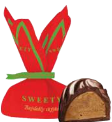
"Baydakly" chocolate sweets with milk filling