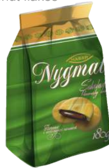
"Nygmat biscuits" with chocolate filling 180g