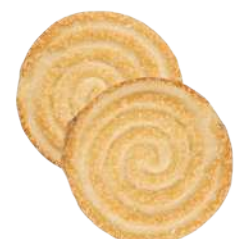
"Aylar" classic sugar cookies