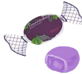
"Currant" candy caramel with liquid filling