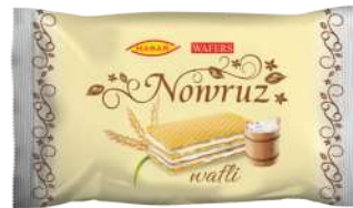
"Nowruz" waffles with taste of melted milk