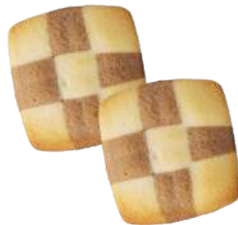
"Horjun" butter biscuit of top quality wheat flour