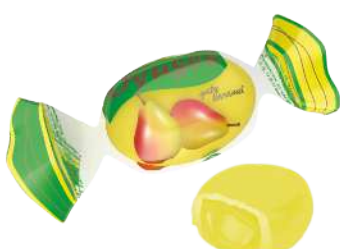
"Duchess" candy caramel with liquid filling