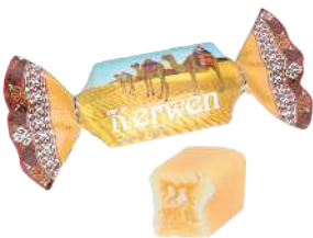
"Kerven" sweets with a creamy flavor from childhood