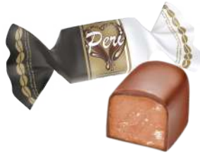
"Peri" fondant with chocolate glaze (Cappuccino)