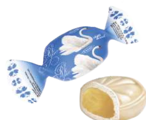
"Ak guv" milk caramel