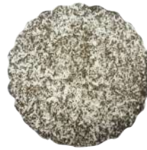
"Petir" classic short dough in chocolate glaze with coconut flakes