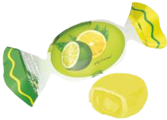
"Lemon" candy caramel with liquid filling