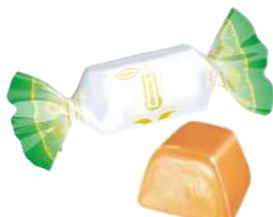
"Ashgabat" toffee with liquid fondant filling