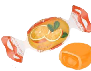
"Orange" candy caramel with liquid filling