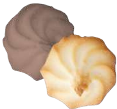
"Tolkun" butter biscuit made from soft and light dough