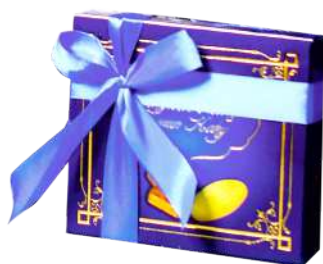
Sweets "Melon in chocolate" 200g