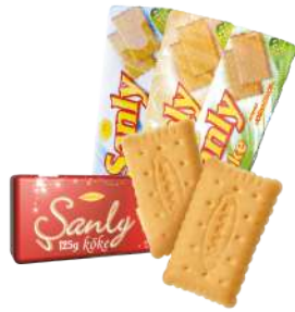
"Shanly" classic short dough cookies 125g