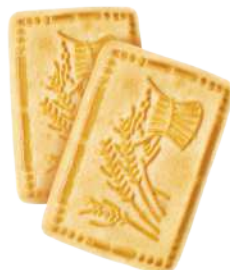
"Sumbul" classic sugar cookies