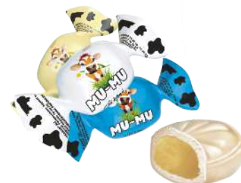
"Mu-mu" milk caramel