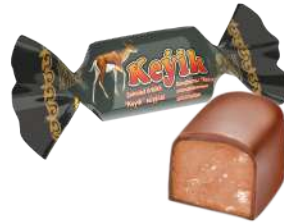
"Keyik" fondant with chocolate glaze (cream-brulee)