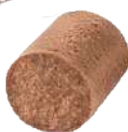
"Ylham" sweets with flavor of ice-cream with cocoa and wafer crumbs