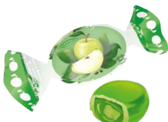
"Apple" candy caramel with liquid filling