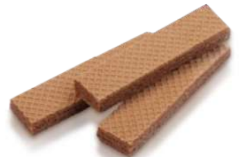
Waffles "Crispy" with cocoa