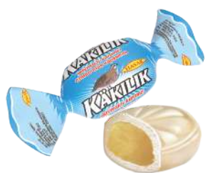
"Kakilik" milk caramel