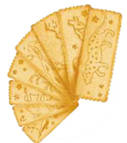
"Bathyz" classic sugar cookies