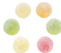
Fruit marmalade in the form of a cap