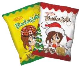
"Balajyk" sugar cookies 20g