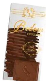
"Bedev" 100g chocolate bars (milk chocolate)