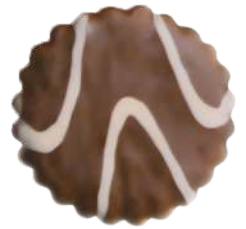
"Petir" short dough chocolate-coated cookies with a creamy pattern