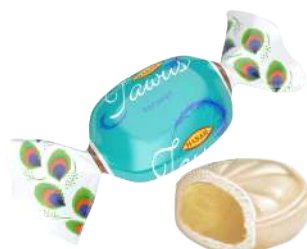
"Tavus" Milk Caramel