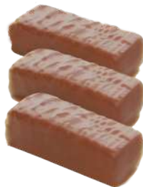
Waffles glazed with chocolate