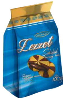
"Lizzet" butter biscuit with chocolate filling 180g