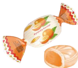
"Orange" classic caramel with liquid filling