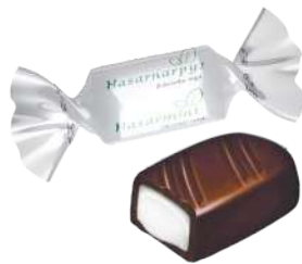
"Hasarmint" chocolate sweets with mint filling