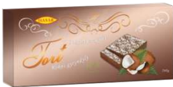
Waffle "Cake" with coconut chips 260g