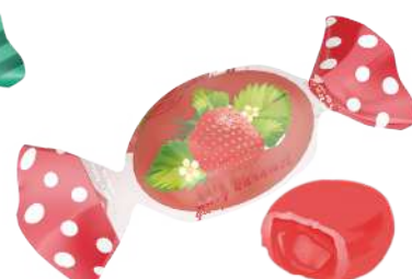
"Strawberry" candy caramel with liquid filling