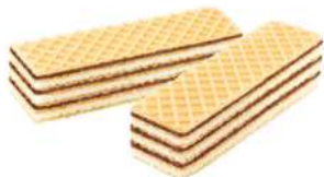
"Delicate" waffles with cocoa filling