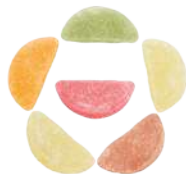
Fruit marmalade slices