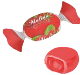
"Raspberry" candy caramel with liquid filling