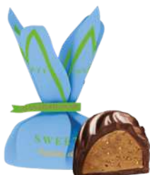
"Baydakly" chocolate sweets with sesame