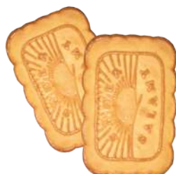
"Saher Salamy" classic sugar cookies