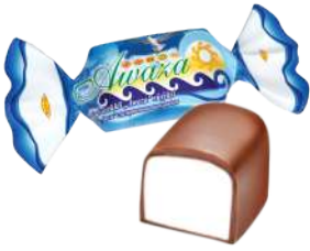
"Avaza" fondant with chocolate glaze (cream)