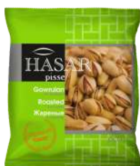
Fried, salty pistachios 60g