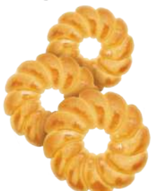
"Alem" classic sugar cookies