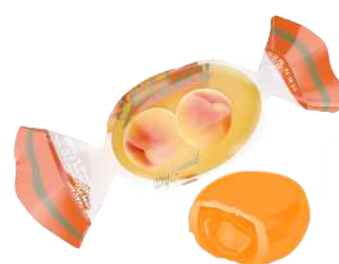
"Peach" candy caramel with liquid filling