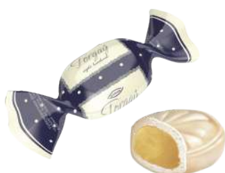
"Torgay" milk caramel