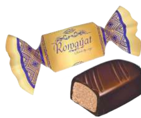
"Rovayat" chocolate sweets with "Mokko" coffee filling