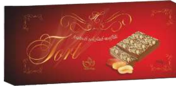
Waffle "Cake" with peanuts 260g