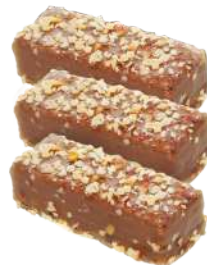
Waffles in chocolate glaze (with crushed peanuts)