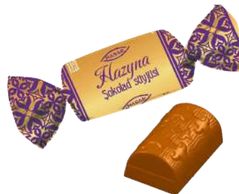
"Hazyna" chocolate sweets made on the basis of a delicate praline with "Tiramisu" liquid filling