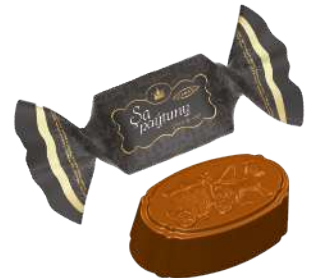
"Sha Paytun" chocolate sweets with filling