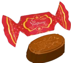
"Sha Paytun" chocolate sweets with filling