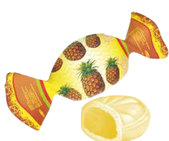
"Pineapple" classic caramel with liquid filling