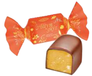
"Golden Autumn" marmalade in chocolate (orange)