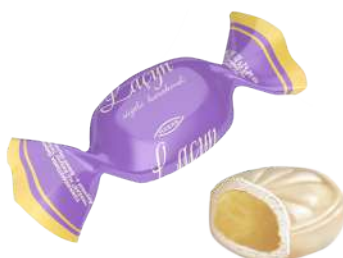
"Lachin" milk caramel