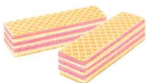
Waffles with strawberry filling