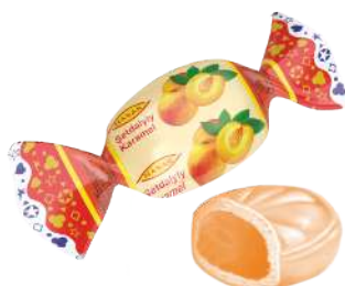
"Peach" classic caramel with liquid filling