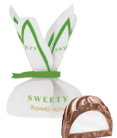
"Baydakly" chocolate sweets with coconut filling