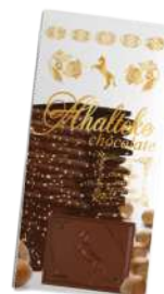
"Akhalteke" 100g chocolate bar (milk chocolate with nuts)