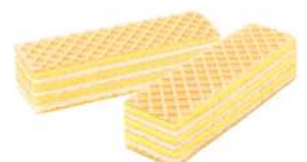
Waffles with lemon filling